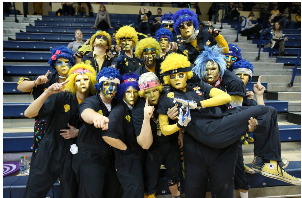
The Blue Crew Alumni Association has created an endowment to assist current and future Blue Crew members with travel, tickets, uniforms, and other costs.