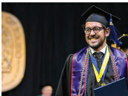
Undergraduate ceremonies, May 6

Ceremonies recognized 791 candidates for doctoral, education specialist and master’s degrees, and 1,749 undergraduate candidates.