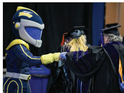
Rocky greets members of University leadership