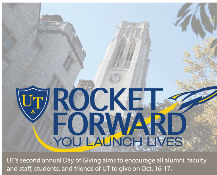
UT's second annual Day of Giving aims to encourage all alumni, faculty and staff, students, and friends of UT to give on Oct. 16-17.

Arts and Letters led the colleges, garnering the support of 99 and 95 donors, respectively. The two colleges also received the additional $5,000 (Nursing) and $4,000 (Arts and Letters) in support for their college progress funds via the donor's gift.